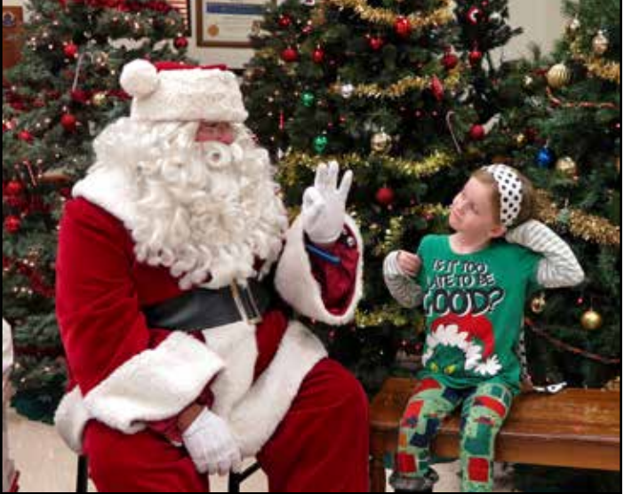
Above: Couldn't help but laugh at this little girl's shirt. Left and Below: Examples of the Holiday Lights around town.