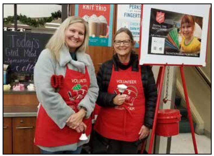
Albert Lea Lakeview Lions Club

Albert Lea LakeView Lions ringing the bells for Salvation Army.