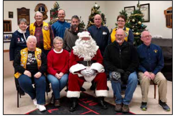
Lafayette Lions gathered for a photo with Santa after he finished talking to the kids.